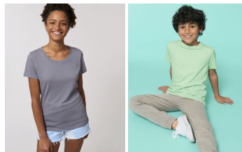
Stella Expresser Mini Creator